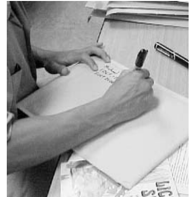
6. The envelope is addressed to the child or in care of parent of guard-