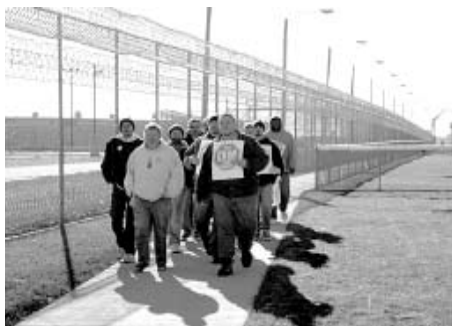
NCCF CROP Walkers