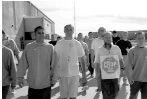
FDCF CROP Walkers